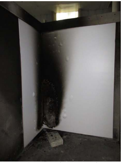
After Test (EN 13823)